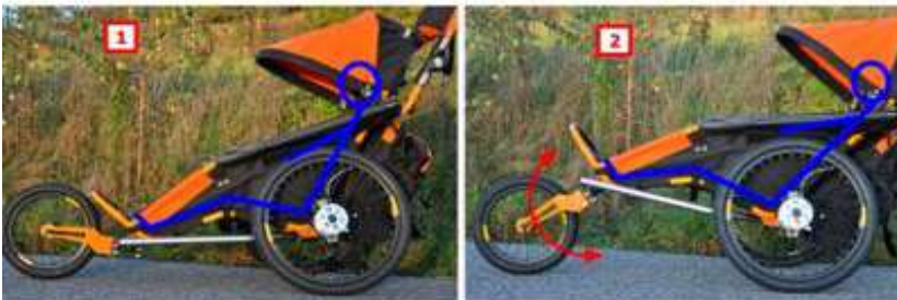
*Wheel angle adjustable for more passenger comfort.