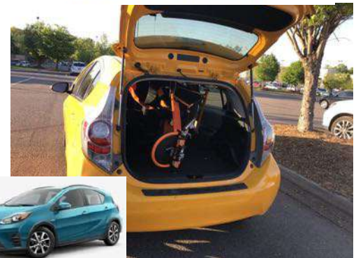
Large XRover in a small car