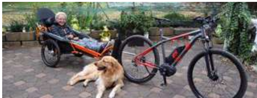
*Pedal assist electric bicycle with battery pulling XROVER.