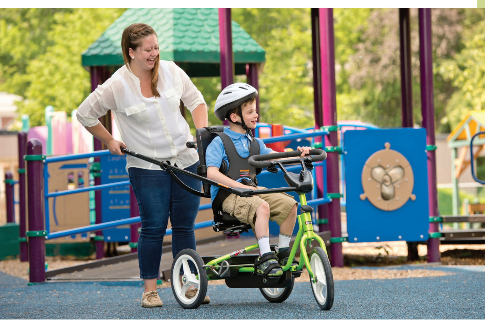
With the rear steering bar the caregiver guides from behind, enabling the rider to see ahead.