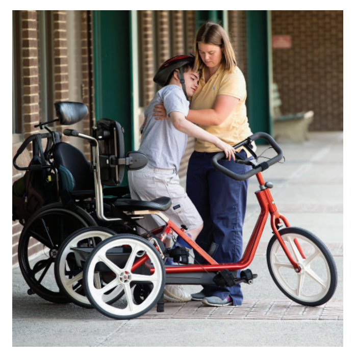
Transfers are made easy with the low step, flip-away loop handlebar and removable laterals.