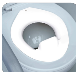
Plastic Reducer Ring