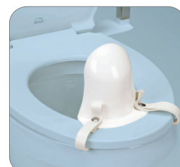
Soft-Flex Splash Guard