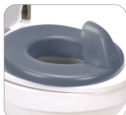
Padded Reducer Ring