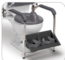
Armrest & Footrest