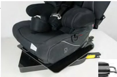
Swivel base w. footrest adapter**