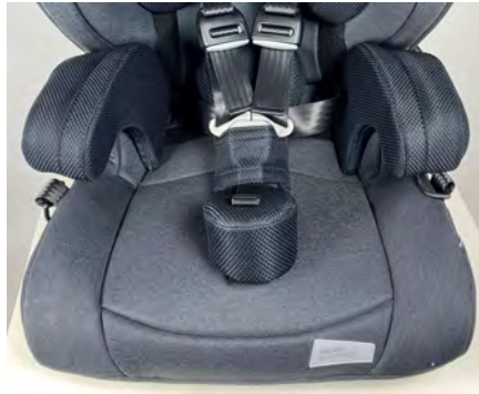
Abduction block, padded