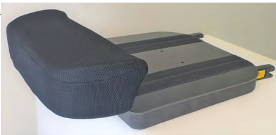
Adapter + Seat depth extension 5" *no swivel