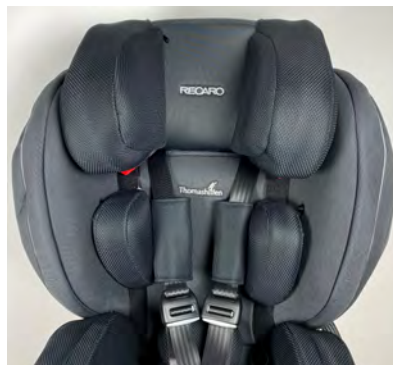
Soft harness strap cover, black