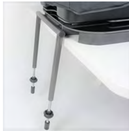
Swivel base w. front stand**