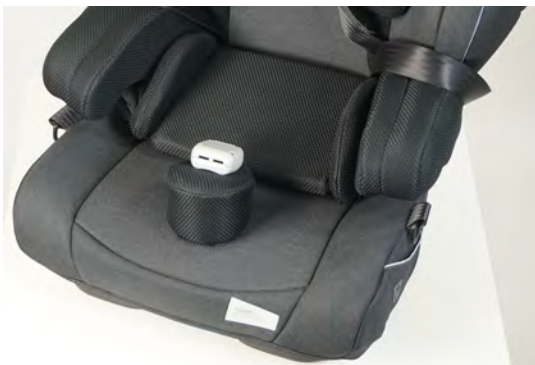
Seat wedge inside