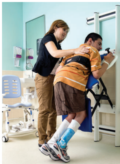
The fixed non-pivot configuration with kneeboard is useful for standing hygiene care, or transfers to commode or wheelchair.