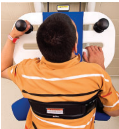
Handholds and slots in the trunk board enable the user to assist in a transfer.