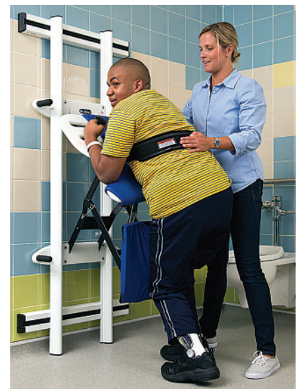
With the kneeboard in use, adjust the trunk board angle to a more upright position to promote increased weight-bearing.