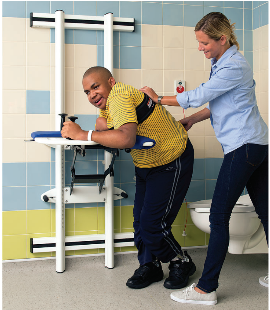
The elbow curves enable a user with limited hand function to assist in a transfer and maintain position on the trunk board.

Beyond toileting: The Support Station can ease the sit-to-stand transition in any setting. Clients can self-assist the stand-pivot transfer from wheelchair to adaptive chair or support themselves in an upright position for clothing changes prior to a swim session.