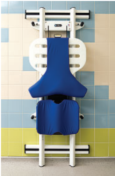
The Support Station folds up flat against the wall when not in use.