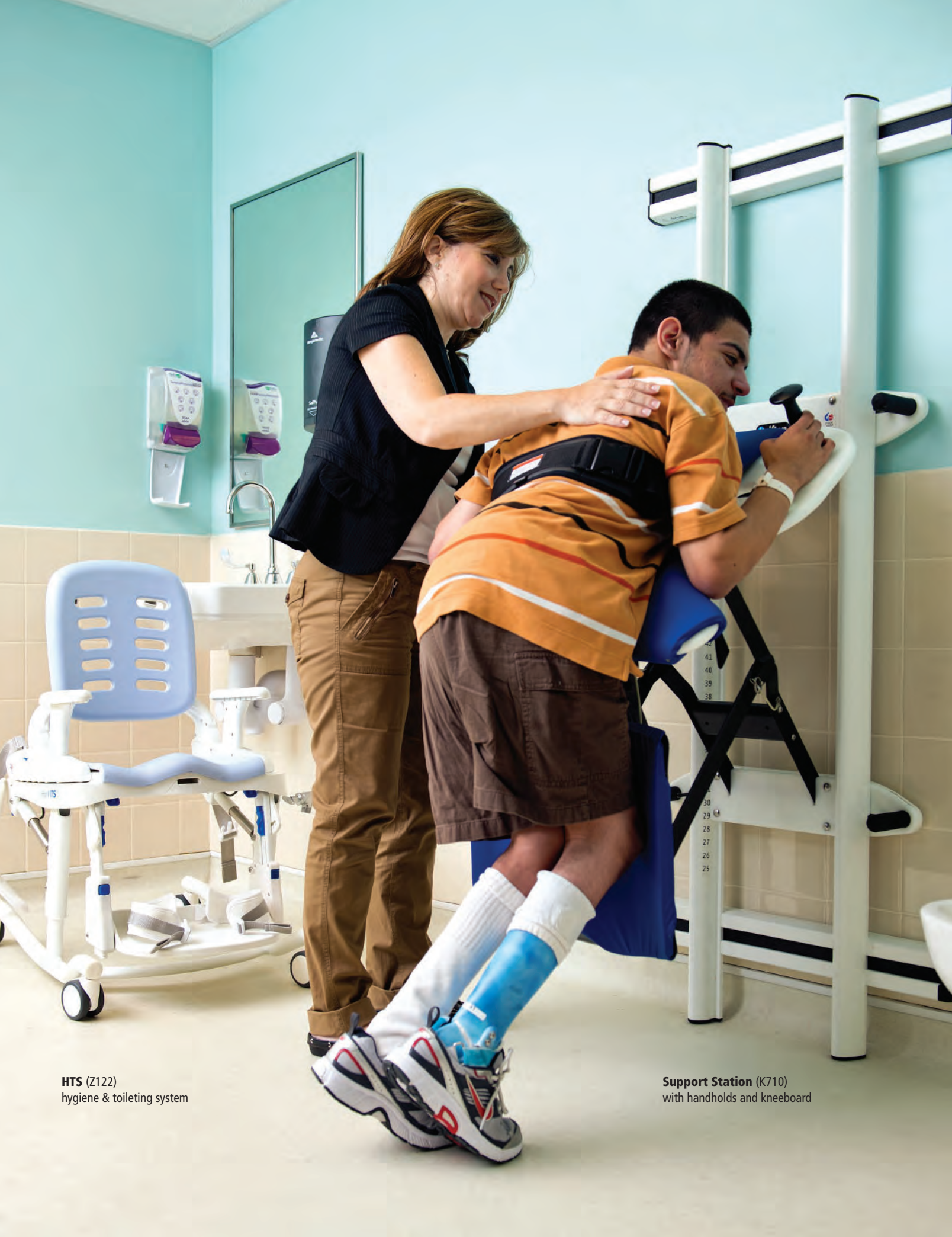
HTS (Z122) hygiene & toileting system