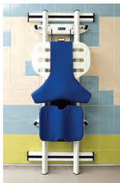
The Support Station folds up flat against the wall when not in use.