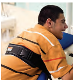
The support strap provides additional security during hygiene care.