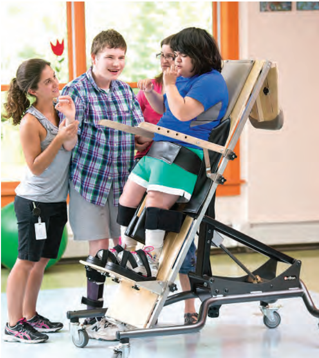
This client has advanced so far that the headrest can now be flipped back out of the way.