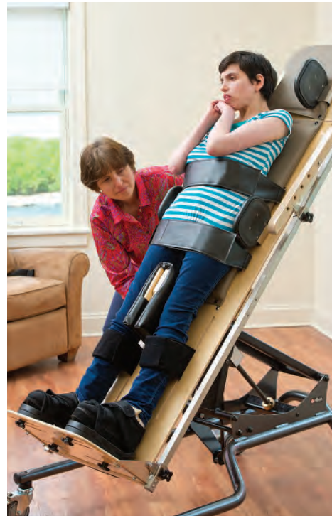
The Supine Stander stays secure at any angle. Turn the crank to gradually increase weight bearing.