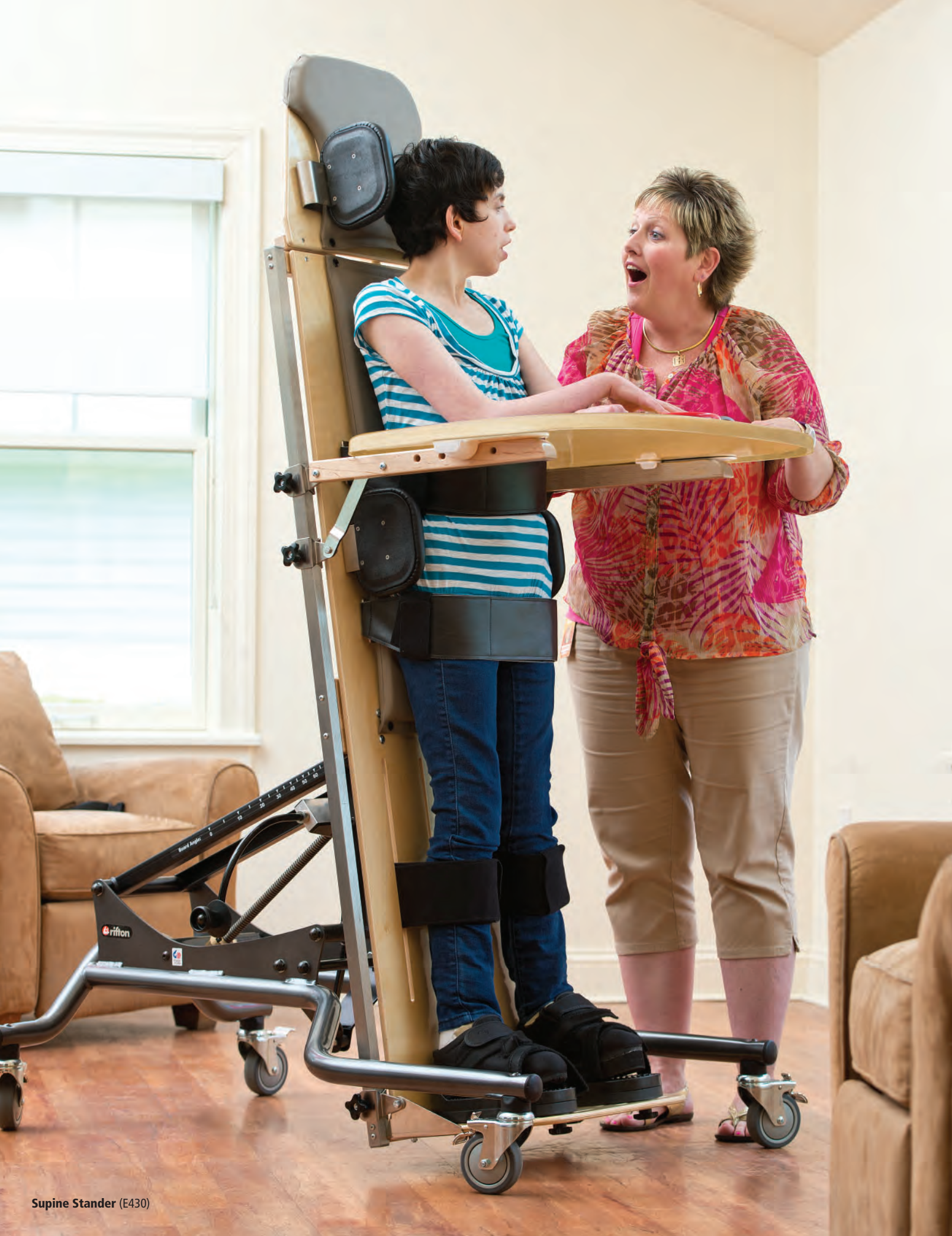
Supine Stander (E430)