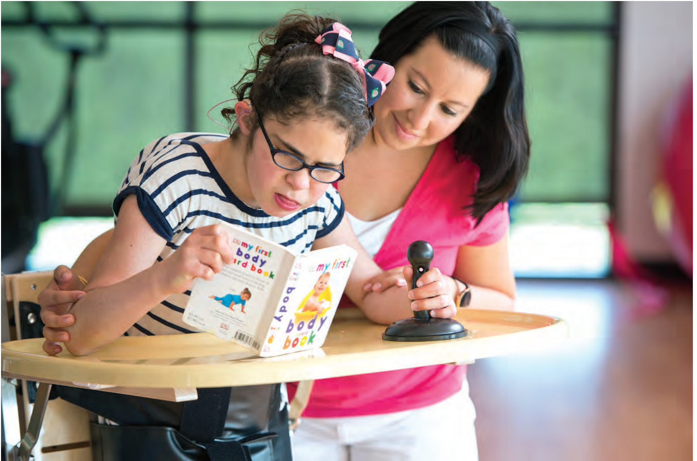
Supported by the hand Anchor, this child is able to participate in activities she enjoys.