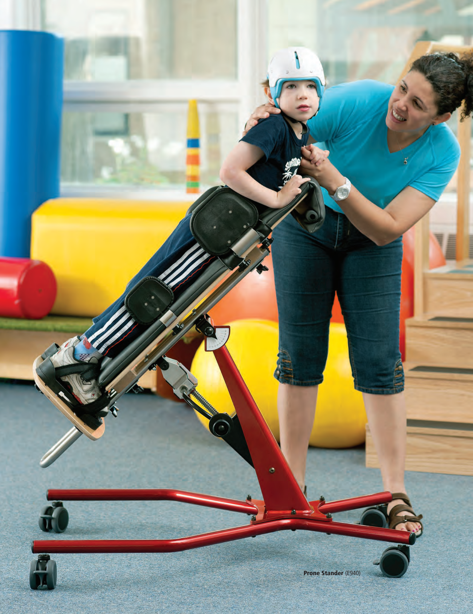
Prone Stander (E940)