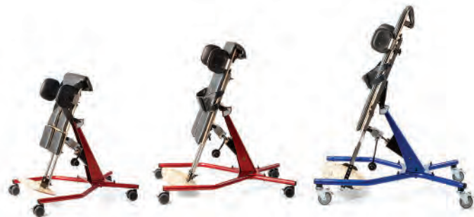
All three sizes are available in red or blue