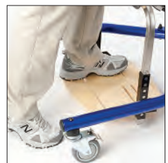
When the stander is vertical, the footboard is almost at floor level, making transfers easy.