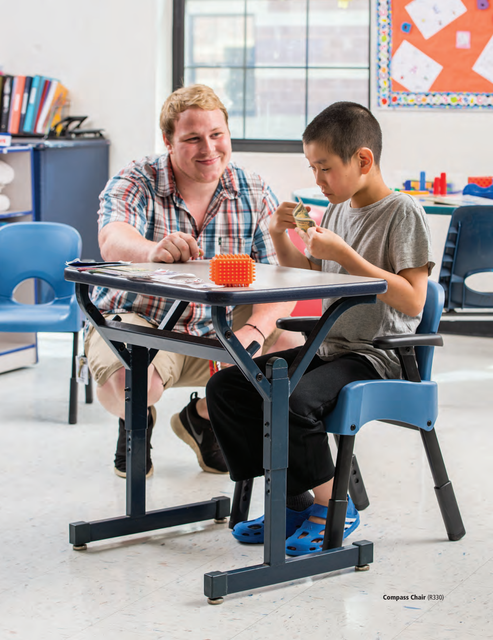
Compass Chair (R330)