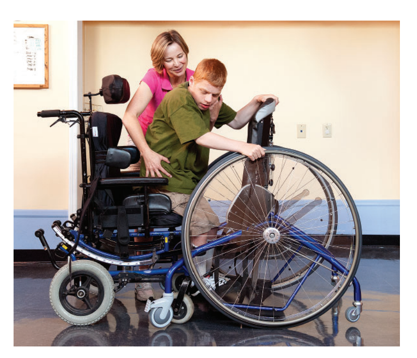
The wide, accessible deck makes transfers easy.