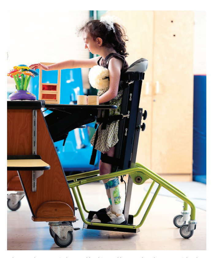
When Carolyn can actively extend her hips and knees to bear her own weight, she is placed in the reverse position. This allows free arm movement as her standing ability develops.