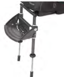
Swivel base w. footrest sz1**