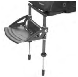
Swivel base w. footrest sz2**