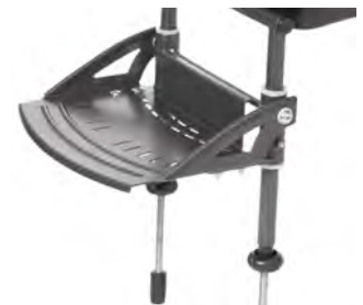
Adapter + Footrest sz2 *no swivel

Specs & pricing are subject to change without notice. HCPCS are suggestions only with no guarantee of reimbursement. ExoMotion LLC dba Thomashilfen | www.thomashilfen.us Effective Date October 1 st 2021