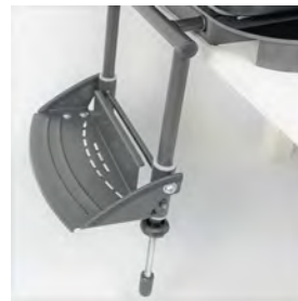
Adapter + Footrest sz1*no swivel