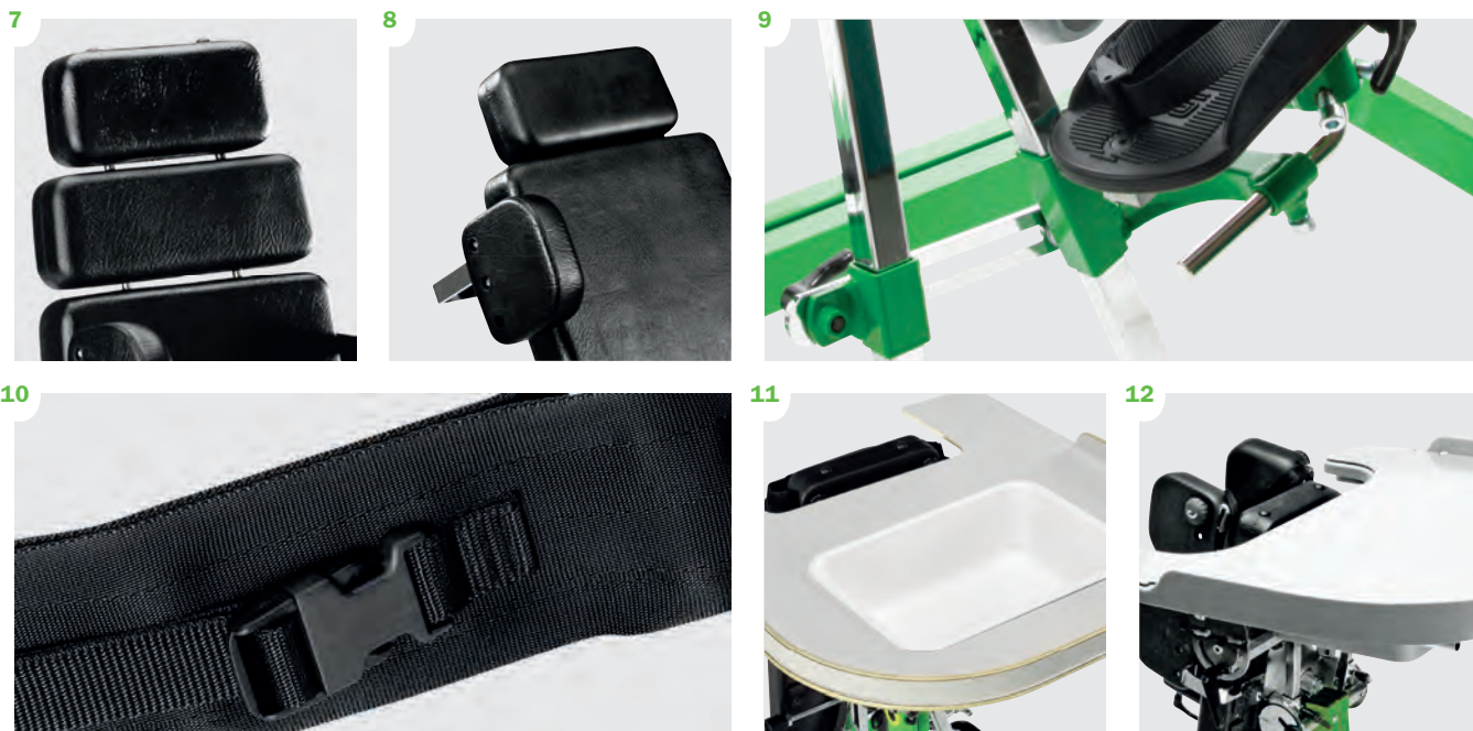
7 Trunk support 88106-x