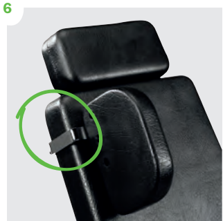
1 Head support system 88124-xx