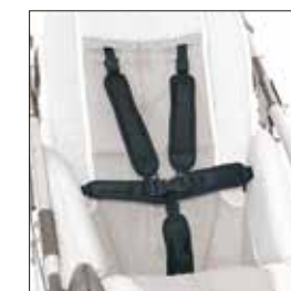
906 FIVE POINT HARNESS