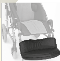
892 FOOT PLATE PADDED COVERING