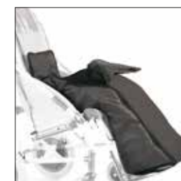
818 THERMAL COVER