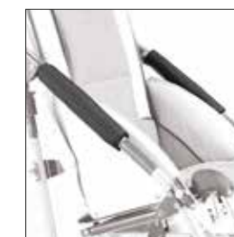
844 SIDE PROTECTING COVERS