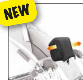
834 ADJUSTABLE ABDUCTION BLOCK