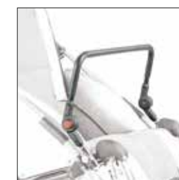
839 FRONT HANDLE