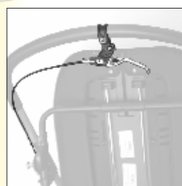
905 HAND BRAKE (rear view)