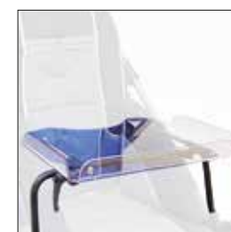
824 TRANSPARENT TRAY