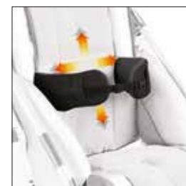
868 SIDE WRAPPABLE and FLEXIBLE SUPPORTS for the trunk. Height and width adjustable