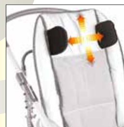
852 HEADREST with Parietal Supports. It is adjustable in height and width