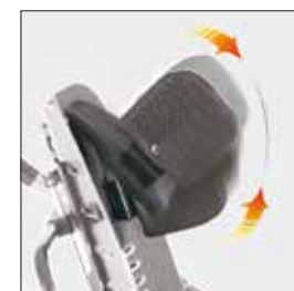
863 HEADREST with Occipital-parietal Supports. It is adjustable in height, in width, in tilt, forwards and backwards