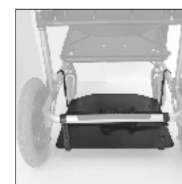
911 VENT TRAY , for carrying medical equipment (rear view)