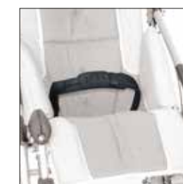
894 45° BELT FOR THE PELVIS