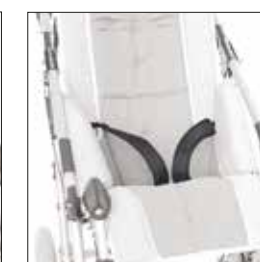
817 INGUINAL STRAPS