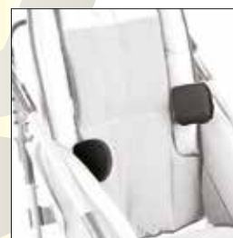
838 PADDED SIDE SUPPORTS