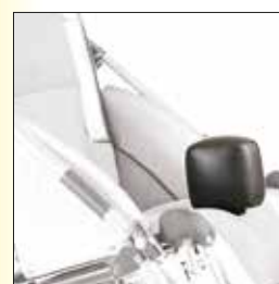
834 ABDUCTION BLOCK