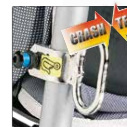
891 SET OF 4 TIE DOWN HOOKS for the forward-facing transport of the pushchair in a motor vehicle (private vans/cars, buses..)