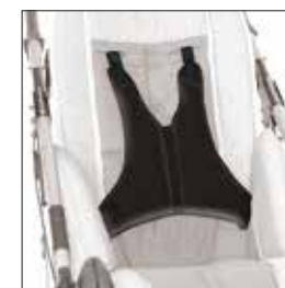
853 VEST HARNESS