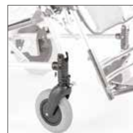
812 WHEEL DIRECTION LOCK