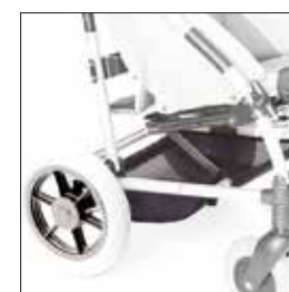
858 MESH BASKET