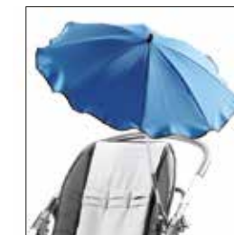
854 PARASOL matching with the upholstery