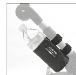
922 BOTTLE HOLDER