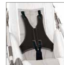
903 FIVE POINT VEST HARNESS