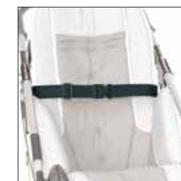
828 CHEST BELT