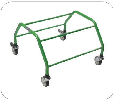
High Rolling Base