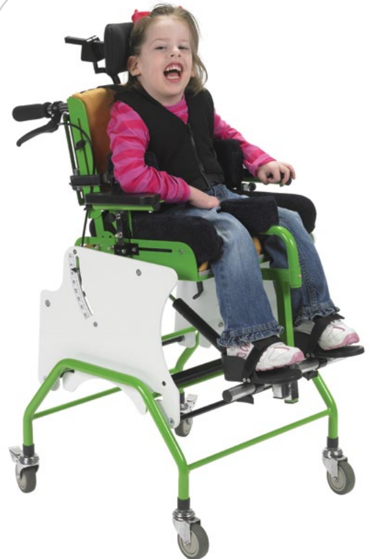
MSS with optional High Rolling Base