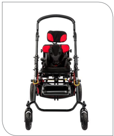
Fire Truck Red