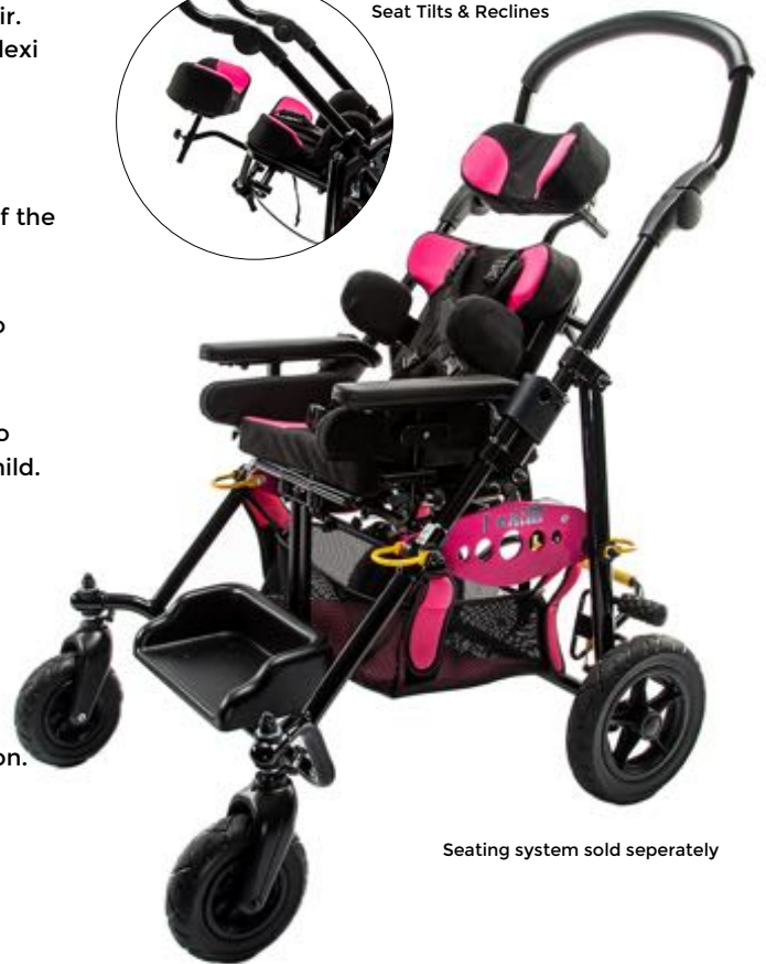
Seating system sold separately