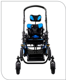
Jet Fighter Blue