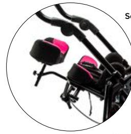
Seat Tilts & Reclines