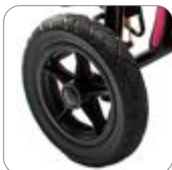
All Terrain Rear Wheel