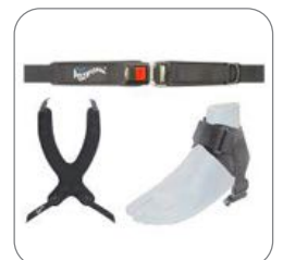
Poziform Belts & Harnesses