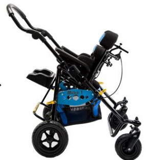
Forward and Rear Facing Seating