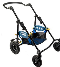
Frame folded for easy transport and storage