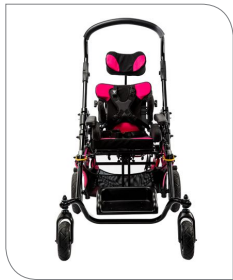
Punch Buggy Pink