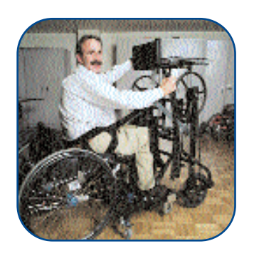
Activate the hydraulic unit to begin the lift and raise the client to a standing position.