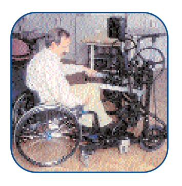
Wheel into unit or roll it up to the client, place the feet and hook onto the lift arms.