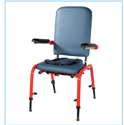
Item # FC 2000N