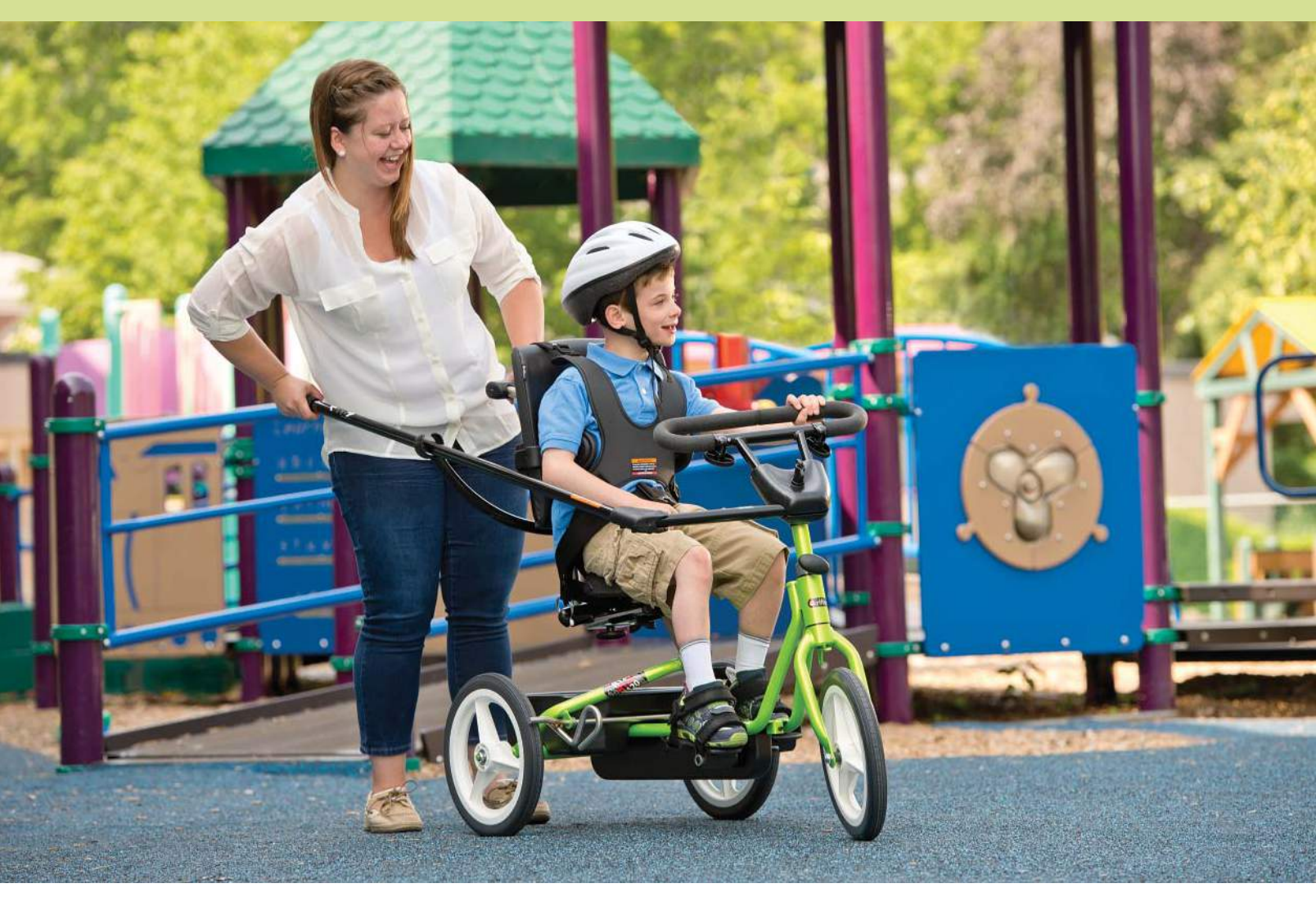
With the rear steering bar the caregiver guides from behind, enabling the rider to see ahead.