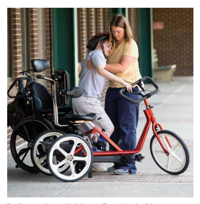
Transfers are made easy with the low step, flip-away loop handlebar and removable laterals.