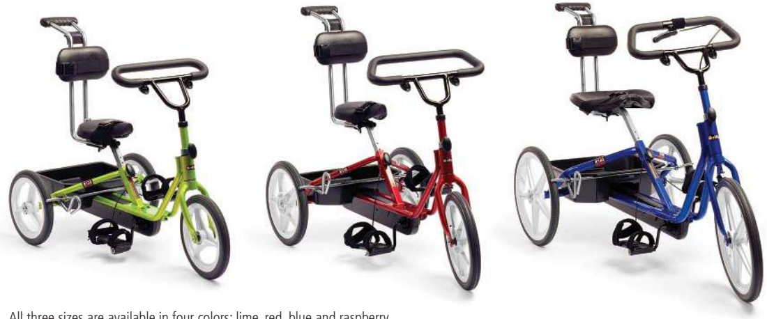
All three sizes are available in four colors: lime, red, blue and raspberry.

are forward of the seat for comfortable reach and efficient pedaling. Feet are secure on the pedals with hook and loop straps.