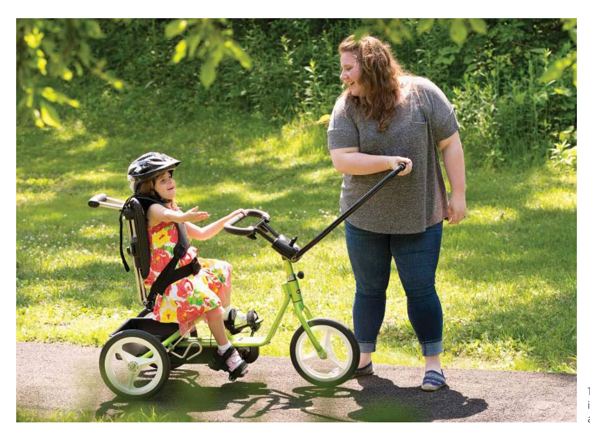
The front guide bar enables interaction between rider and companion.