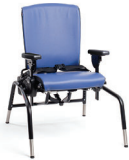
Large standard base R860 Rifton Activity Chair