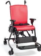
Large hi/lo base R870 Rifton Activity Chair